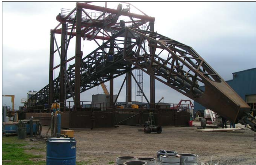
After fabrication and testing, the Marlin mining dredge was disassembled and loaded onto 23 tractor trailers for transport to the Florida "pond" where it will operate until the middle of the 21st century.