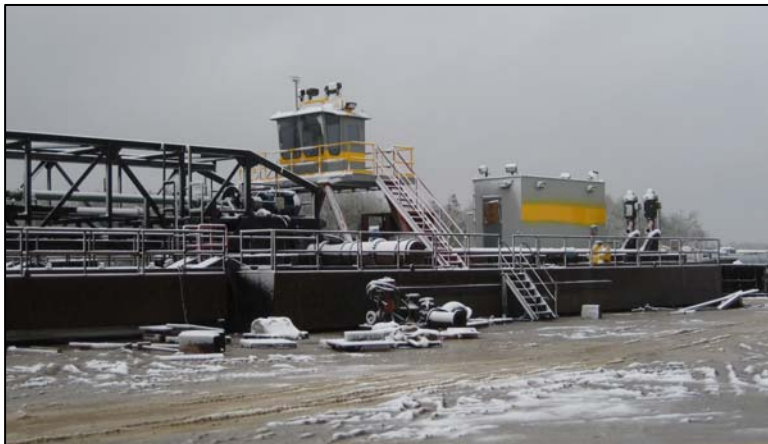
A rare dusting of snow in Reserve, Louisiana covers the lever room, electrical room and equipment.

"This dredge will be in the pit for a long time and since you will not be able to access any underwater connections, we designed all of the pontoons so they would be bolted together above the water surface.," he said.