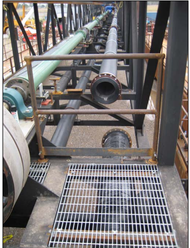
Six green Form-Flex® disc couplings (aka, drive shafts or torque tubes) from TB Wood's, Chambersburg, PA, connect the underwater suction pump to the 600 HP electric motor on the ladder of the dredge. The drive train is the longest ever built for a mining dredge and is specifically modified for operation in the vertical position.